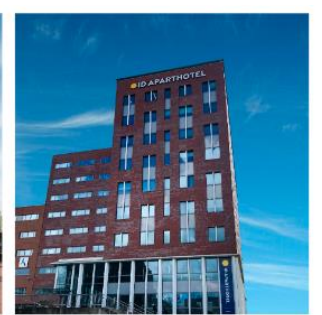
The July Amsterdam Twenty Eight ID Aparthotel Amsterdam The July Amsterdam Boat & Co