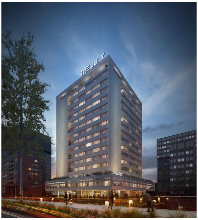
The July Amsterdam South Axis